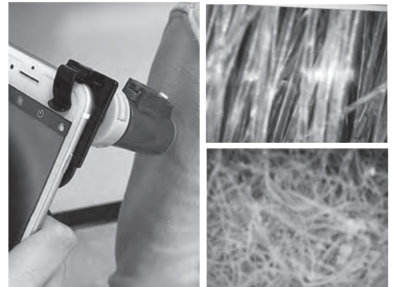
Pictured: Students use a cell phone and the Smart Science device to look at the thread patterning of a sweatshirt; Microimages captured by students of human hairs and a whiteboard eraser, respectively using the Smartscope.

As part of a unit that involved the discovery of each student's own values and skills, Mr. Arcuri's high school Health Education students were asked to come up with a service or product that relates to their hidden genius. Students used Adobe Spark to create websites highlighting a product or service they designed around their personal strengths. Students could also combine their hidden genius with each other to come up with a product that incorporated the skills of multiple students. For example, one student who valued farming, and another who valued art, combined their skills to create a website that sold custom designed t-shirts with farm themes to raise money for local farmers. So many skills gained in one project!